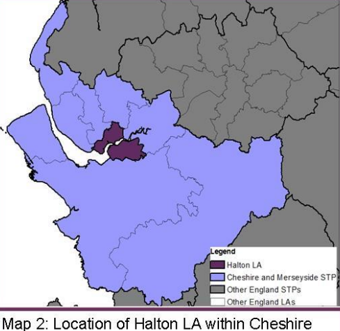
Map 2: Location of Halton LA within Cheshire and Merseyside STP. Halton CCG and the HWB cover an almost identical footprint.